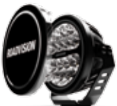
RDL6701LKD 7" LED Driving Light 10-30V Round 74W Combination Beam