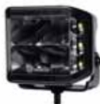
RWL7470C LED Work Light 10-30V Square 70W Combo