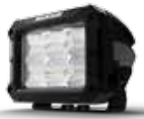
RWL30F LED Work Lamp Flood Beam 10-30V 6 x 5W LED's 30W IP67