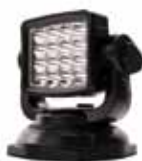
RVRWL LED Work Lamp Remote Controlled Spot Beam 16 x 3W LED's Black Housing